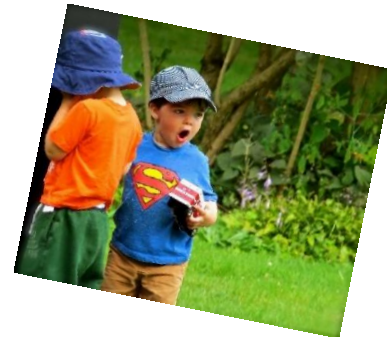
3 rd Place