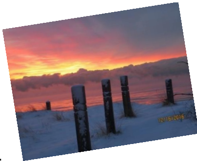
1 st Place