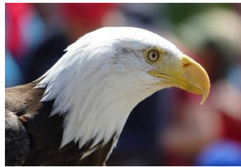
2 nd Place